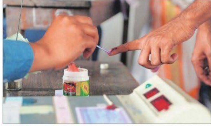
COST OUT: An estimate puts the election expenditure in 2014 at over Rs 30,000 crore.

No doubt, frequent elections are becoming unsustainable. The arguments in favour and against holding simultaneous elections are selective and inferential. Those who favour the idea highlight the fact that elections are held in about half a dozen states every year. And, the material cost to the governments and the stakeholders is phenomenal. The expenditure incurred by the political parties in the 2014 Lok Sabha elections, as mentioned in a report by the Association of Democratic Reforms. was around Rs 1,587.78 crore. However, unofficial sources estimate that the total expenditure by the candi-