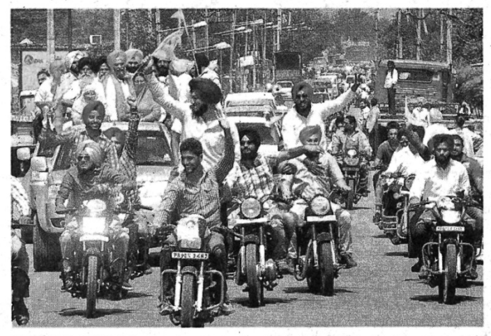
FIGHT, NO CAUSE: No party has a transformational agenda for Punjab.

These axes lay down broad boundaries for the politics to function. Electoral alliances and coalitions have been formed with even diametrically opposed political parties. The Congress and the Akali Dal even merged in 1937, 1948 and 1956. Most Akalis who joined the Congress did not return to the Akali fold. Prominent among them