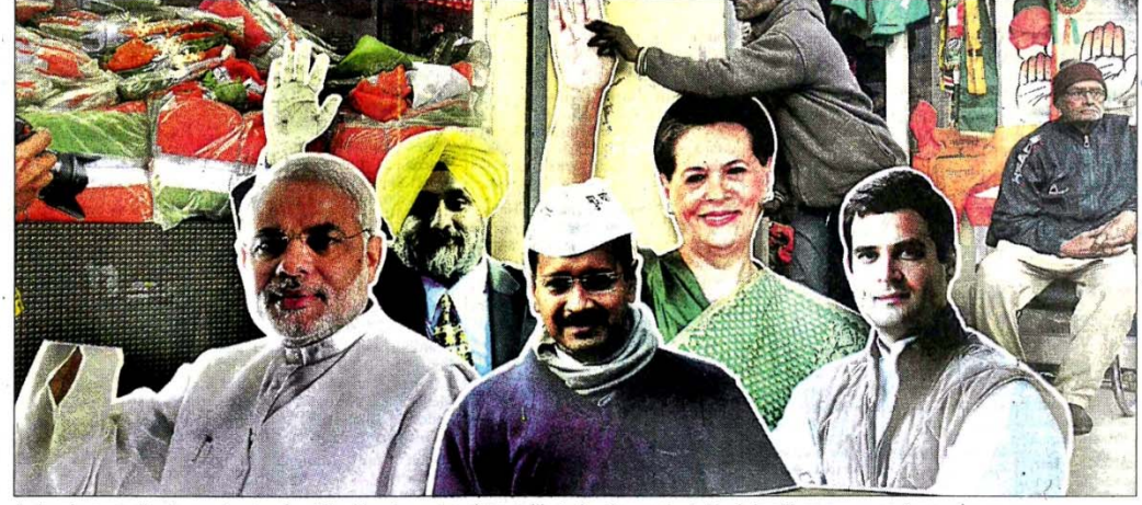
A shopkeeper displays cutouts of political leaders at a shop selling election material in Jalandhar.

During elections, political parties promise jobs, doles and subsidies. When in government, they reduce employment in the public sector to improve the fiscal health of